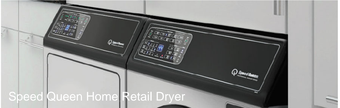
Speed Queen Home Retail Dryer