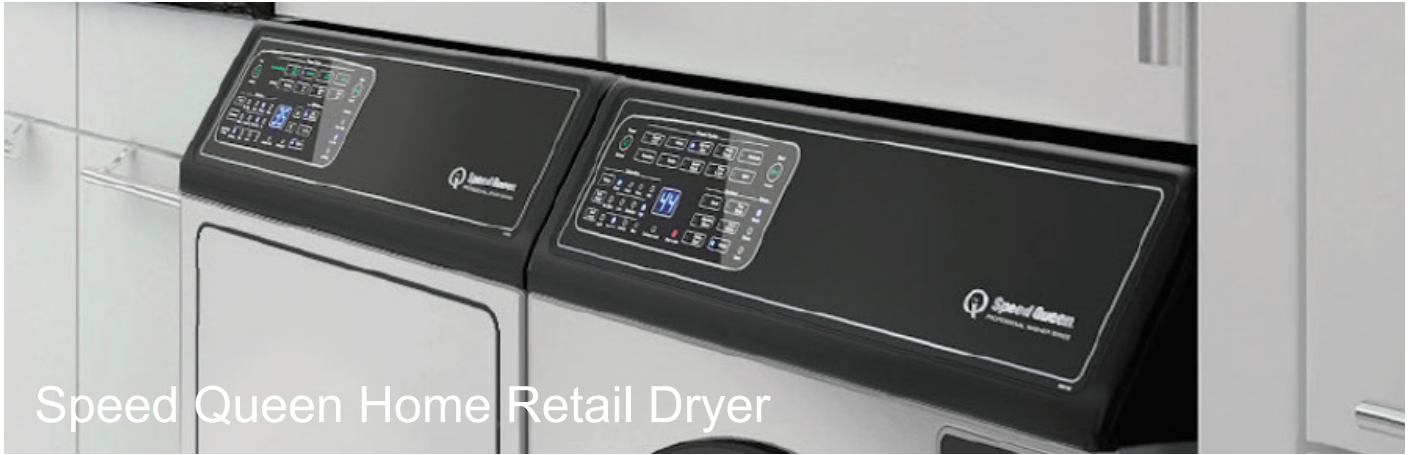
Speed Queen Home Retail Dryer